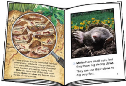
Typical Page Layout

Check out the website: www.webothread.com